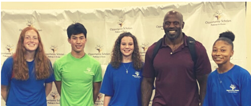
Pro football great Ken Harvey stands with students on Day 3 of the Opportunity Scholars Career Camp. Harvey is now a motivational speaker who says he doesn't want to be known only as an NFL player, but also for his good works.